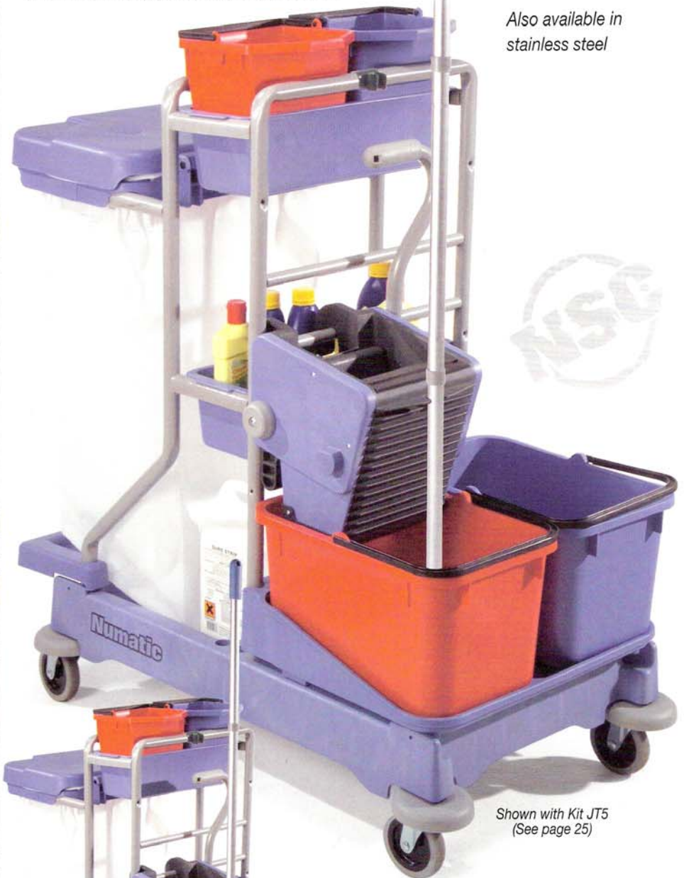
Shown with Kit JT5 (See page 25)