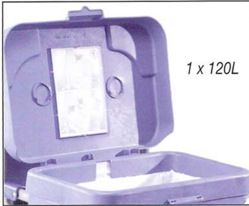
1 x 120L