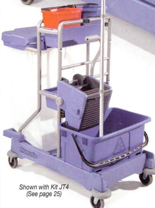
Shown with Kit JT4 (See page 25)