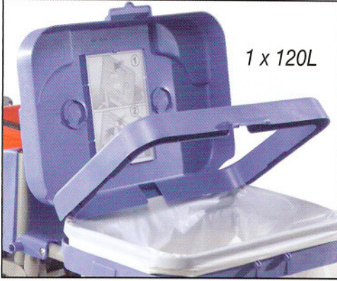
1 x 120L