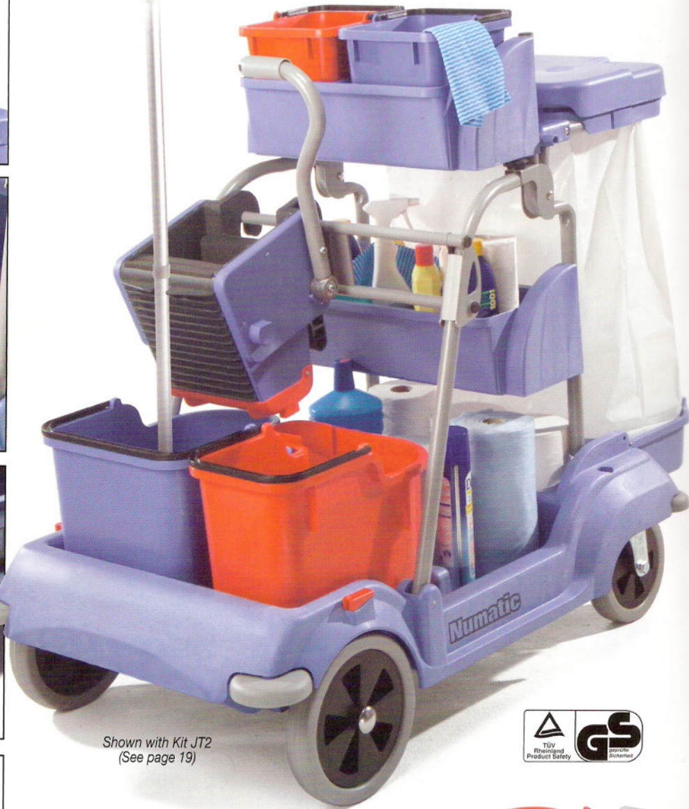
Shown with Kit JT2 (See page 19)